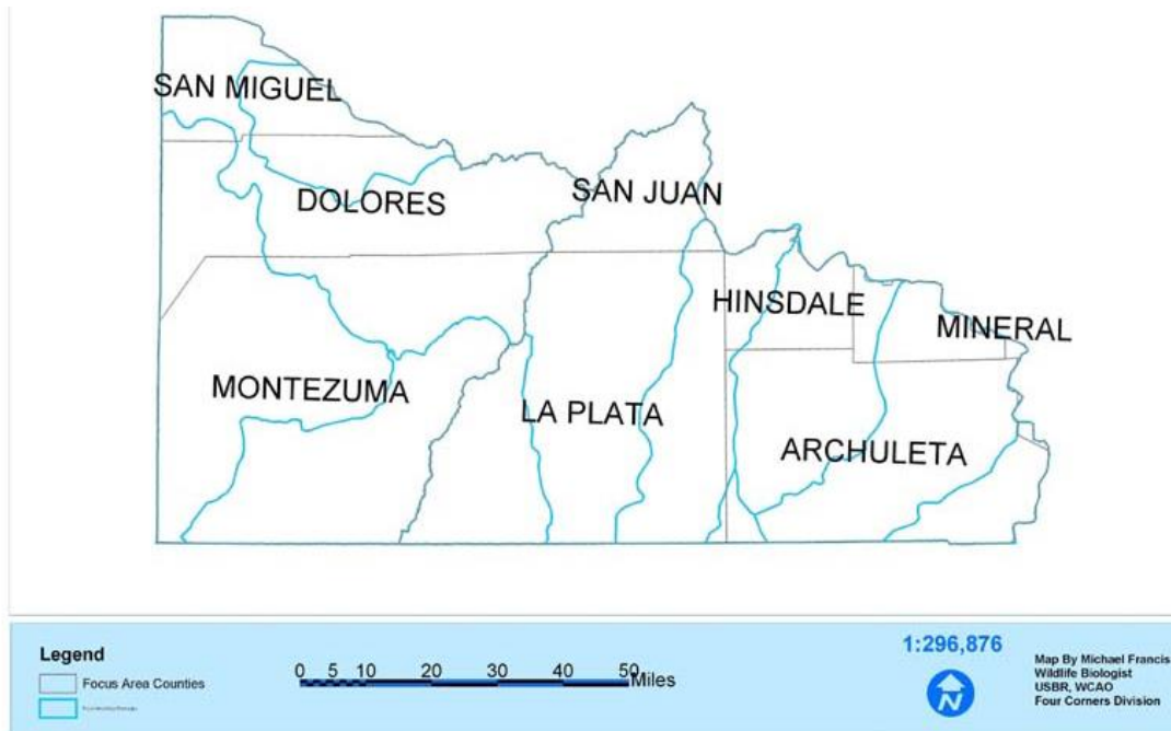
Figure 1. Map of counties in the Southwest Wetland Focus Area.